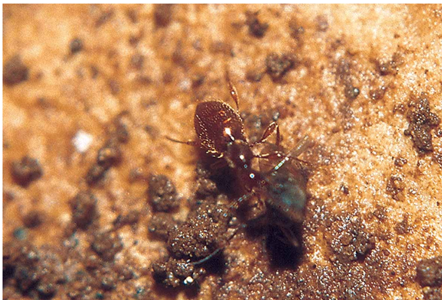
Fig. 11. Euconnus ( Tetramelus ) bazgoviensis from Bazgovačka jama.

The occurrence of E.(T.) bazgoviensis in the cave is clearly not just accidental. Its facies (more or less common to other cavernicolous Coleoptera of different families as Carabidae, Staphylinidae and Leiodidae) and several other morphological particularities indicate an evolutionary adaptation to the cavernicolous habitat: pronotum