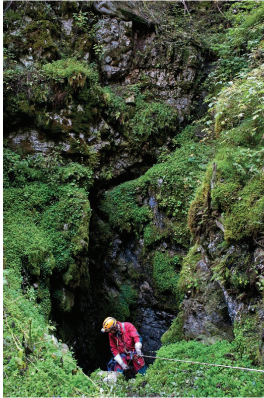
Fig. 7. Entrance of Golovranica pit.