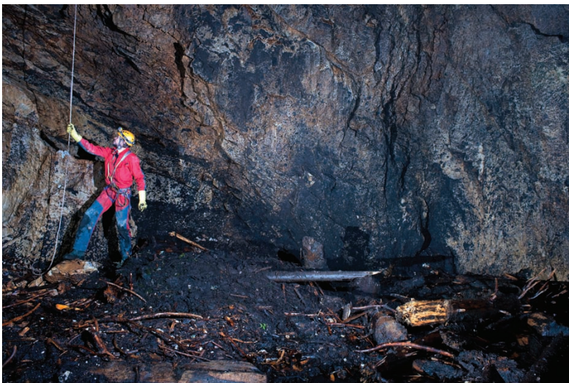
Fig. 8. Bottom of Golovranica pit, place of finding of Acheroniotes golovranicensis sp. nov.